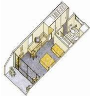
Hotel Room $210