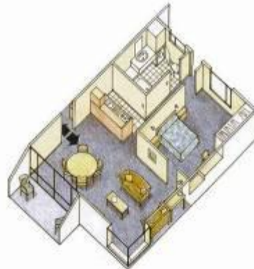
One Bedroom Suite $270