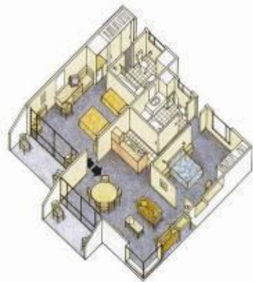
Two Bedroom Apartment $480

Edgewater is the perfect place to relax in comfortable yet sophisticated surroundings. Our superb lake front location provides uninterrupted views from all rooms with direct lake access. The ambience created by the stunning natural beauty and a relaxed atmosphere provides you and your delegates with a serene place to rest your heads and wake up feeling rejuvenated. We are pleased to extend special conference accommodation rates to you and your delegates if you choose Edgewater as your conference venue. The rates include a full breakfast buffet for your delegates as well. We have three styles of rooms to choose from: